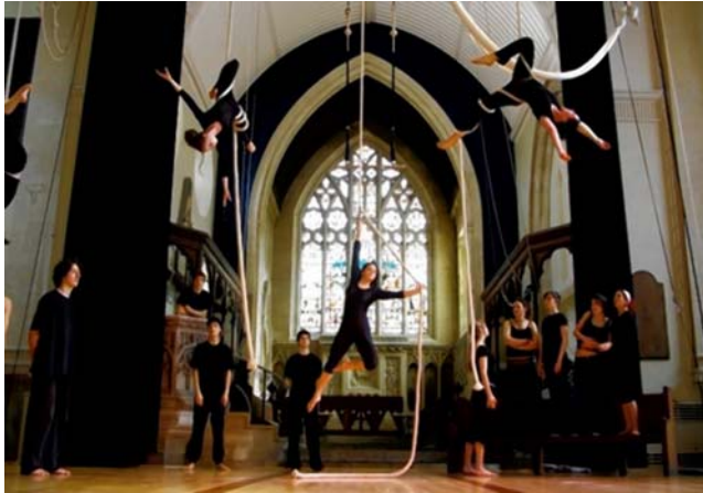
The former St. Paul's Church in Bristol, England, is now the Circomedia circus training school.