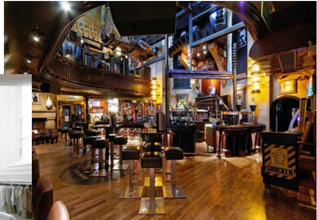
A former Lutheran church in Edinburgh became a Frankenstein-themed bar.