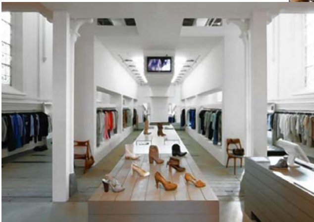
A 19th-century church became a clothing store in Arnhem, Netherlands.