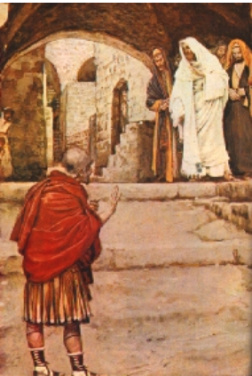
"Lord, I do not deserve..." James Tissot, 1886-96

Our first scripture reading is from the apostle Paul. Paul went around and talked about Jesus. He wrote letters to churches cheering them on so that they would keep following Jesus even when it was hard. Sometimes we need someone to cheer us on and we are blessed because we have one another here at Central.