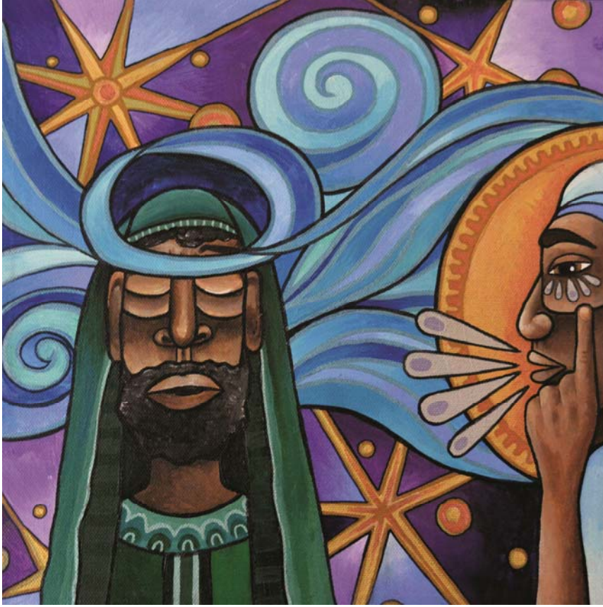
Born Again From Sanctified Art