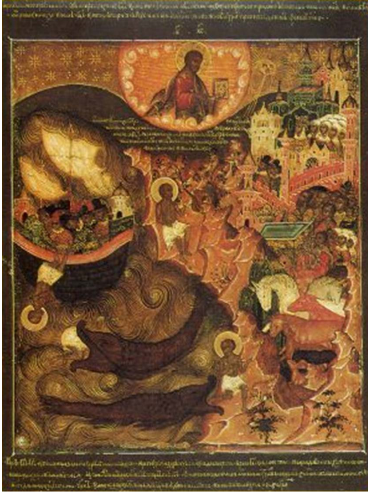
Jonah the Prophet Icon of the Orthodox Church