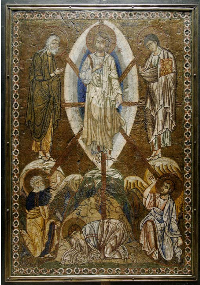
Transfiguration of Christ Dating from the twelfth century, this portable icon consists of very tiny mosaic tiles. It is currently at the Louvre in Paris.