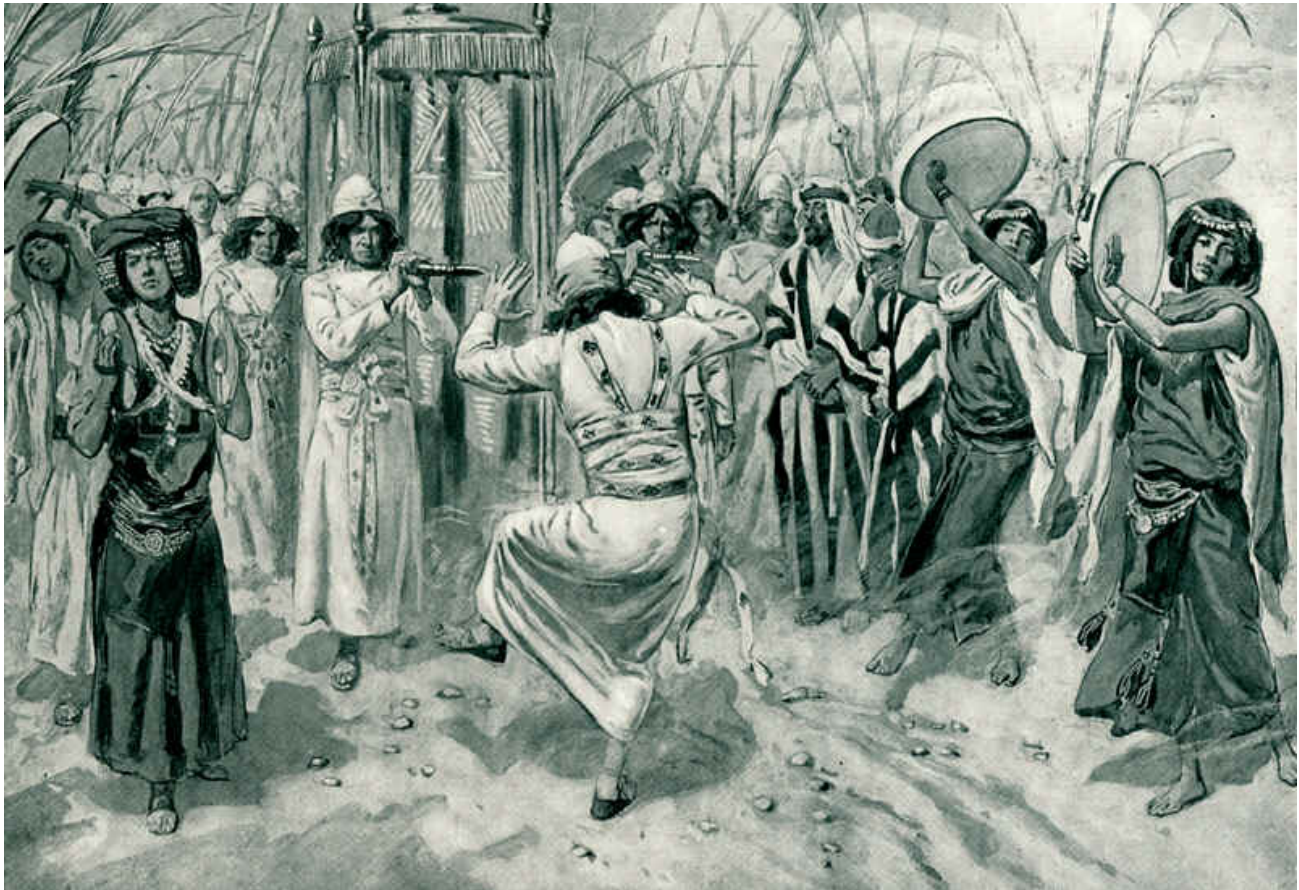
David Dancing Before the Ark, James Tissot, 1896-1900

JULY 15, 2018 | FIFTEENTH SUNDAY IN ORDINARY TIME