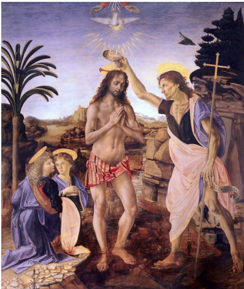
Baptism of Christ Andrea del Verrocchio, 1435-1488 and Leonardo da Vinci, 1452-1519 Uffizi Gallery, Florence, Italy