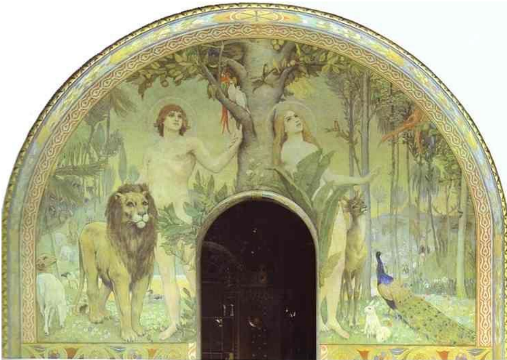
The Bliss of Paradise Victor Vasnetsov, 1885-96. Fresco. Cathedral of St. Vladimir Kiev, Ukraine