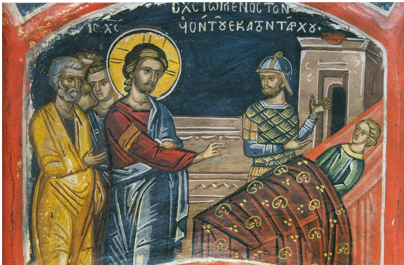
Christ Healing the Son of the Centurion from the Dionysiou Monastery on Mount Athos