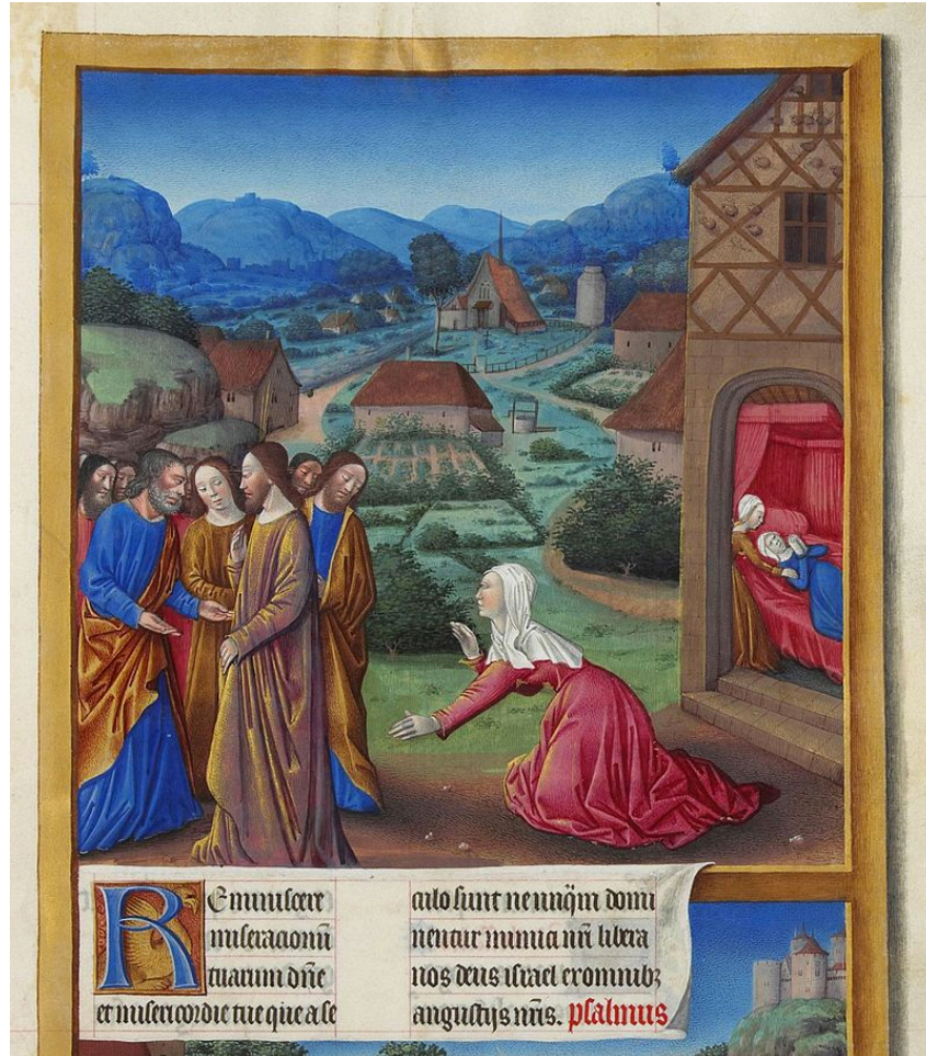
Jesus exorcising the Canaanite Woman's daughter from Très Riches Heures du Duc de Berry , 15th century.