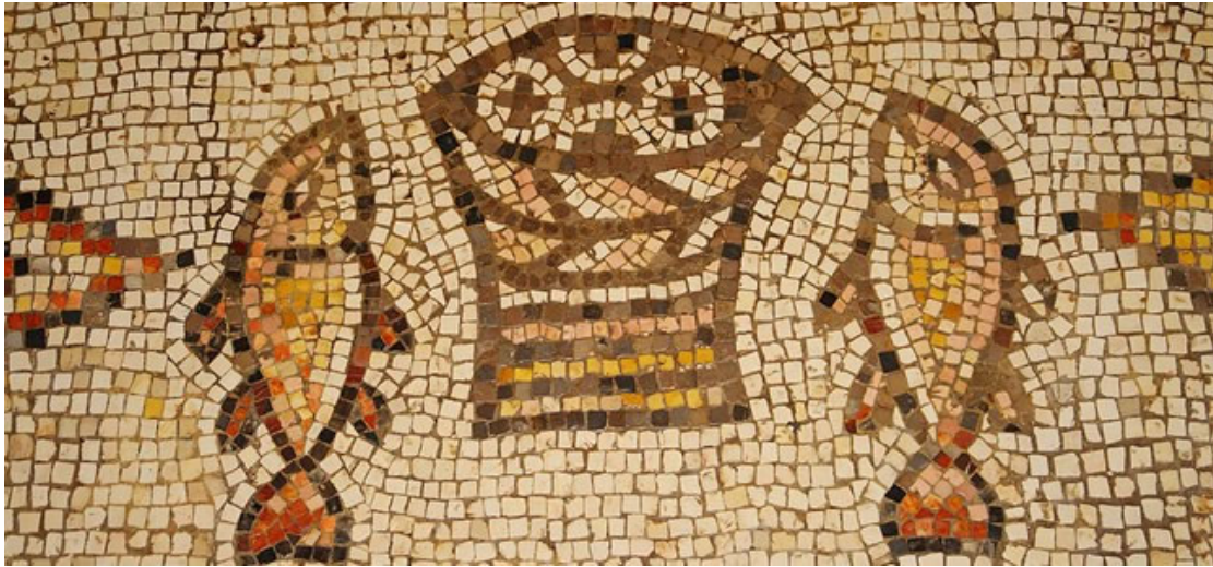
Mosaic | The Church of the Multiplication of the Loaves and Fishes, Tabgha, Israel