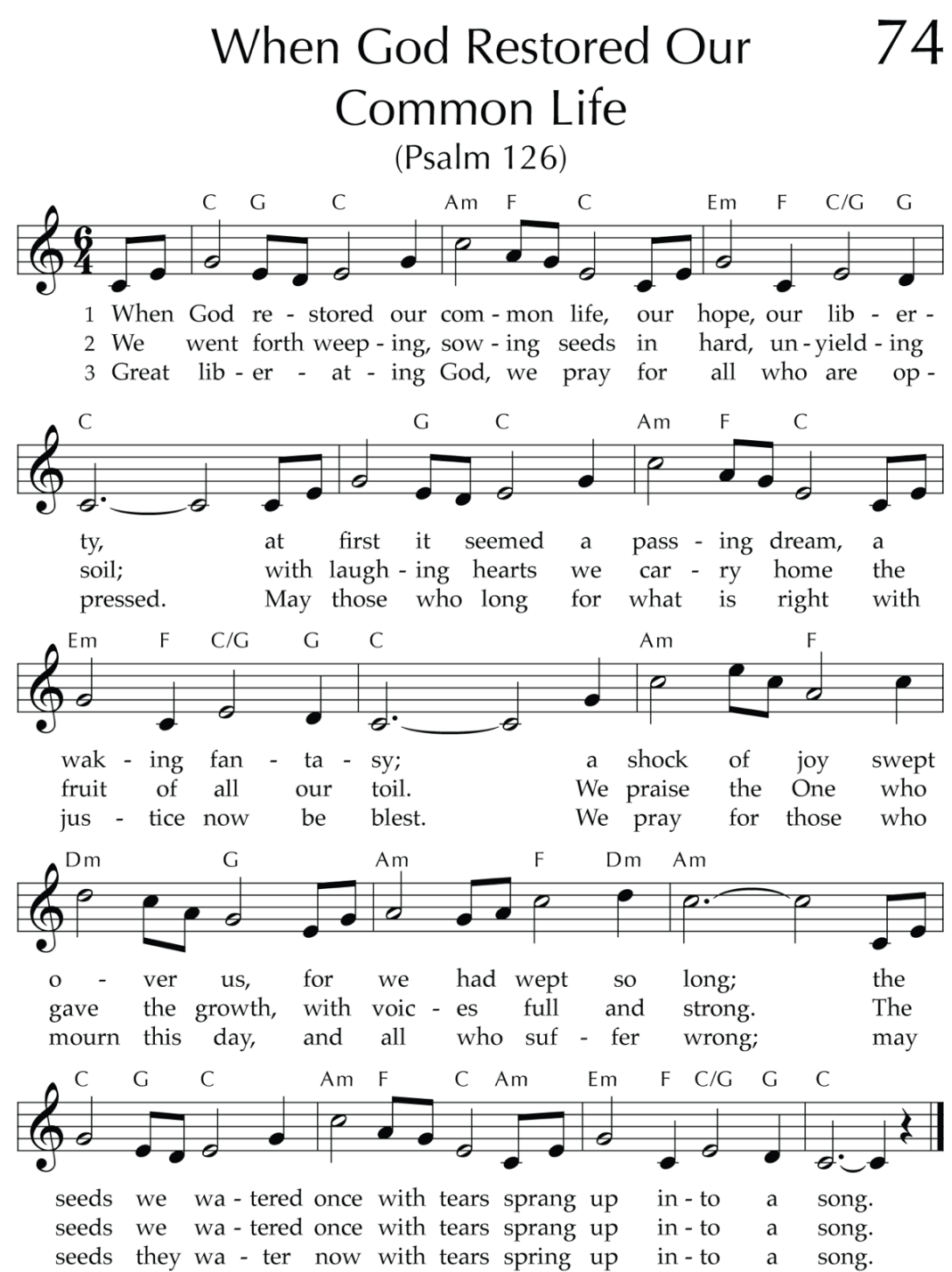
Guitar chords do not correspond with keyboard harmony.

This paraphrase brings Psalm 126 to life in two ways: by turning the "they" of the final verses of the psalm to "we," and by adding a prayer for all who still wait for release from oppression. The shape note tune provides just the right balance of gratitude and urgency.