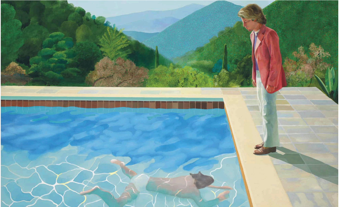
'PORTRAIT OF AN ARTIST (POOL WITH TWO FIGURES)' BY DAVID HOCKNEY

January 23, 2022 Third Sunday after Epiphany Worship begins at 11 a.m.