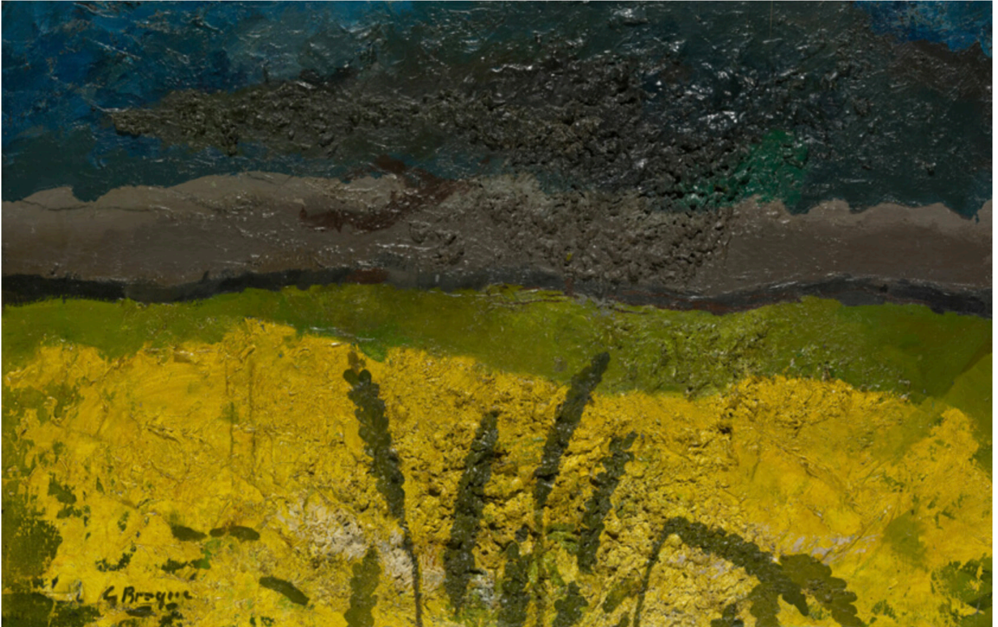
'WHEATFIELD' BY GEORGES BRAQUE

April 3, 2022 The Fifth Sunday in Lent 11 a.m.