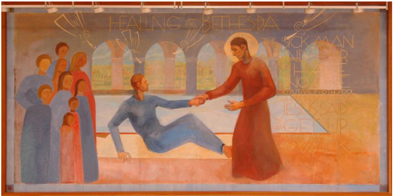
'HEALING AT BETHESDA.'

May 22, 2022 Sixth Sunday of Easter Worship begins at 11 a.m.