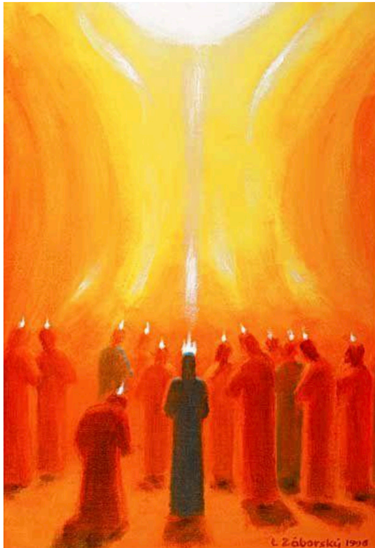
'PENTECOST' BY LADISLAV ZABORSKY