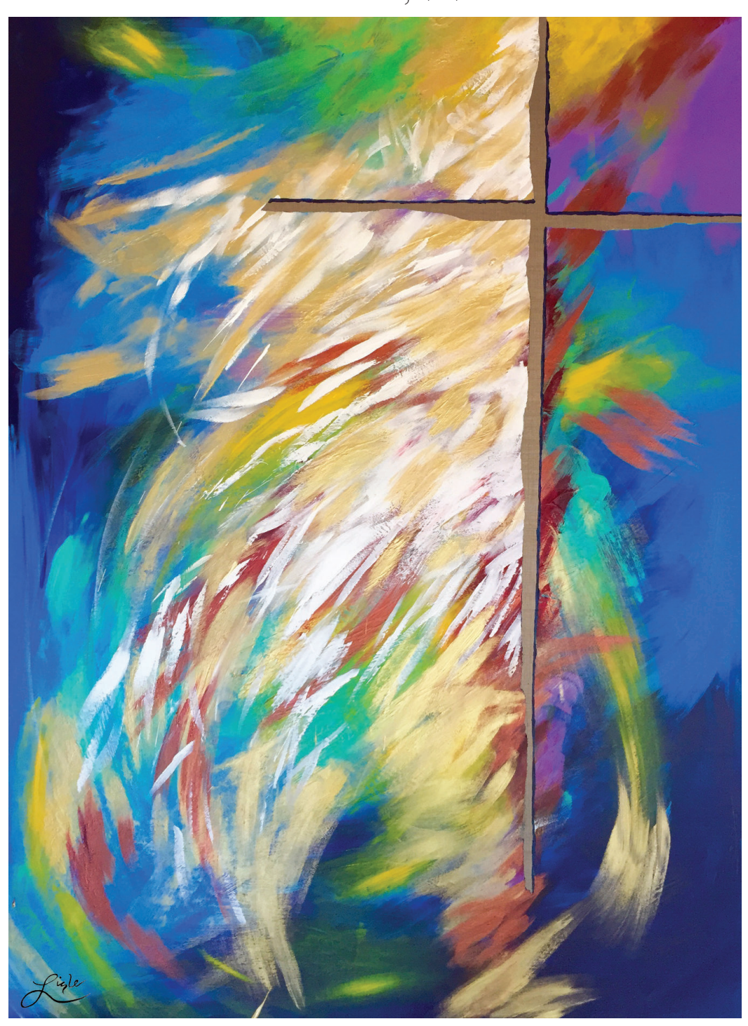
Mourning Light, Lisle Gwynn Garrity