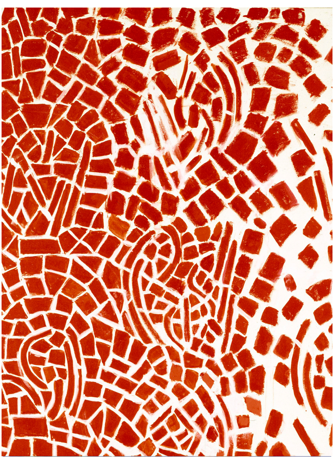
Alma Thomas, Untitled (Music Series)