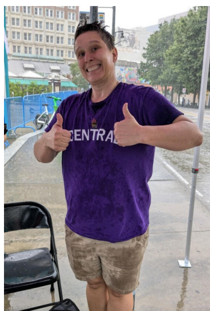
Central members and staff braved the stormy weather on Sunday afternoon to represent Central at "Streets Alive" on Peachtree Street. For this event, The City of Atlanta closed Peachtree Street Sunday afternoon to automobile traffic