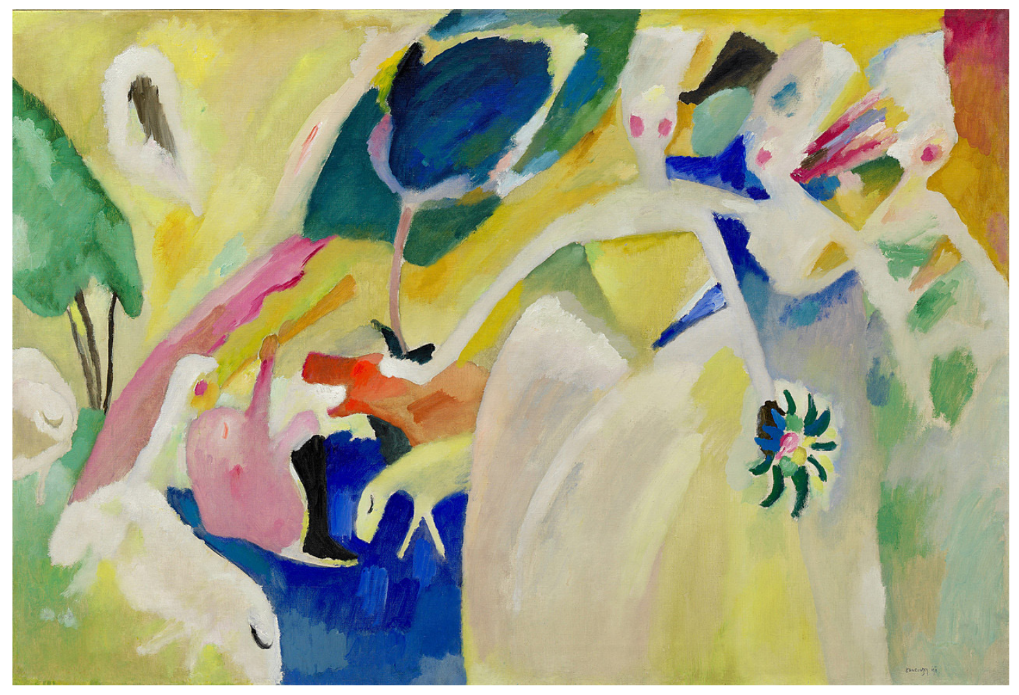
Pastorale, Vasily Kandinsky