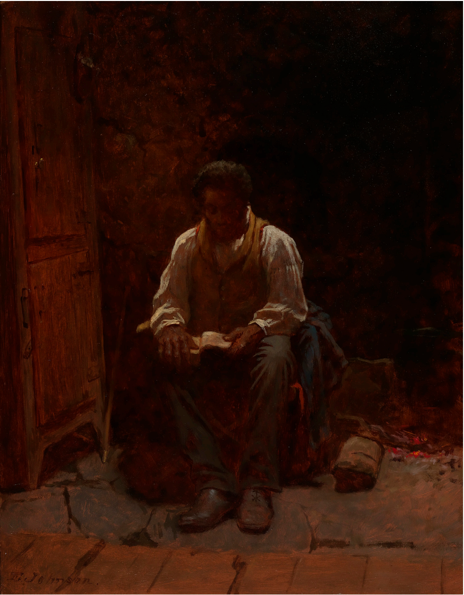
The Lord Is My Shepherd , Eastman Johnson